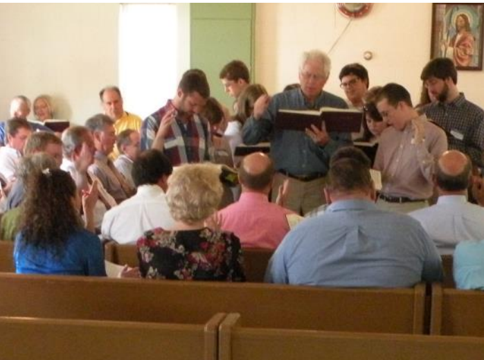
Sacred Harp singing